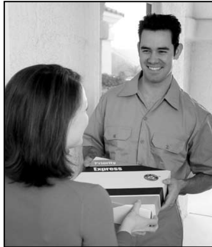
Total convenience! Your lessons, equipment...everything is delivered right to your doorstep. What could be easier?

Computers have revolutionized the pharmacy industry. Discover computer programs that help control inventory and expedite customer service.