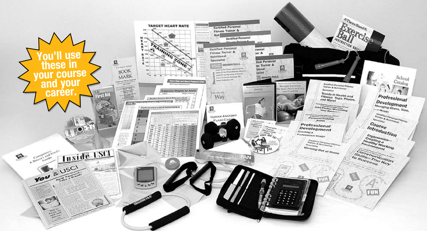
Items shown are for our Fitness Plus course.

You'll use these in your course and your career.